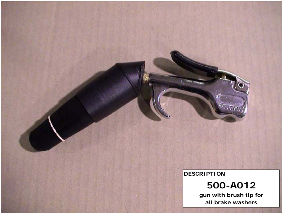
DESCRIPTION 500-A012 gun with brush tip for all brake washers