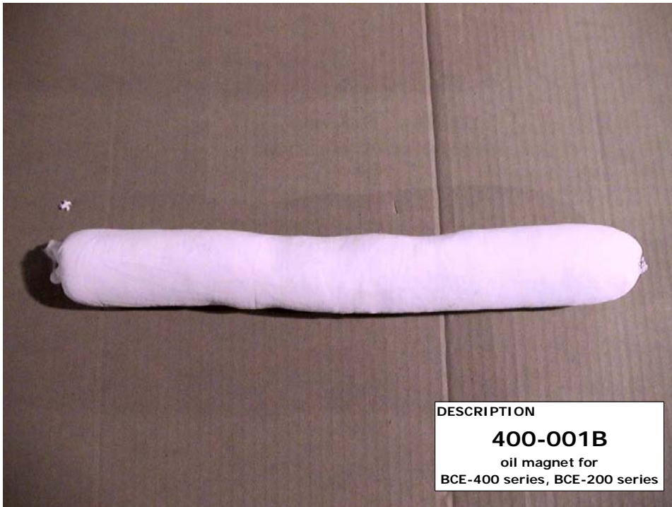
DESCRIPTION 400-001B oil magnet for BCE-400 series, BCE-200 series