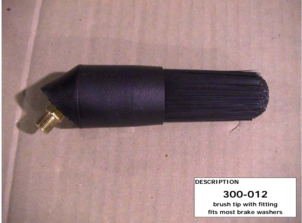
DESCRIPTION 300-012 brush tip with fitting fits most brake washers