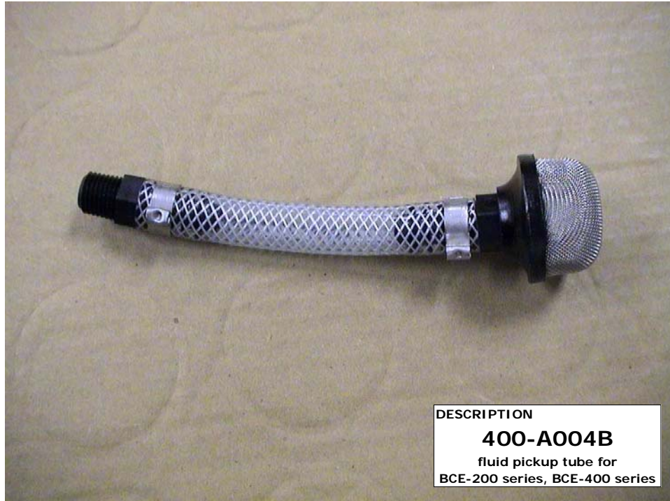
DESCRIPTION 400-A004B fluid pickup tube for BCE-200 series, BCE-400 series