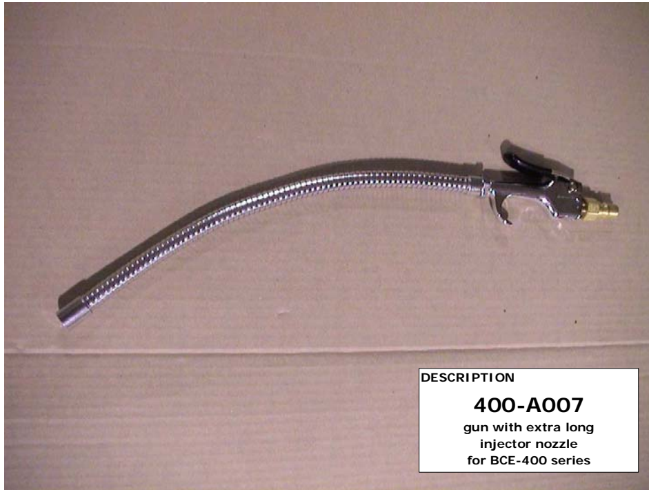
DESCRIPTION 400-A007 gun with extra long injector nozzle for BCE-400 series