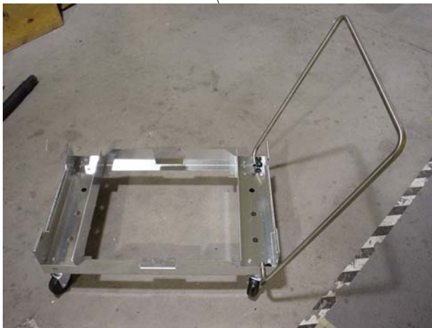
400-001 Truck Washer Dolly