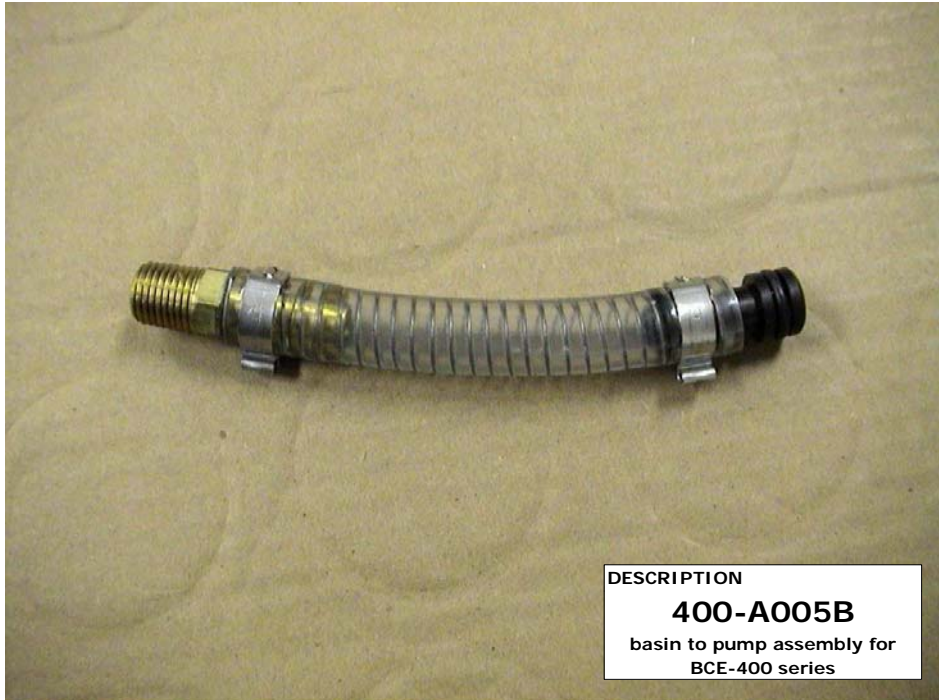
DESCRIPTION 400-A005B basin to pump assembly for BCE-400 series