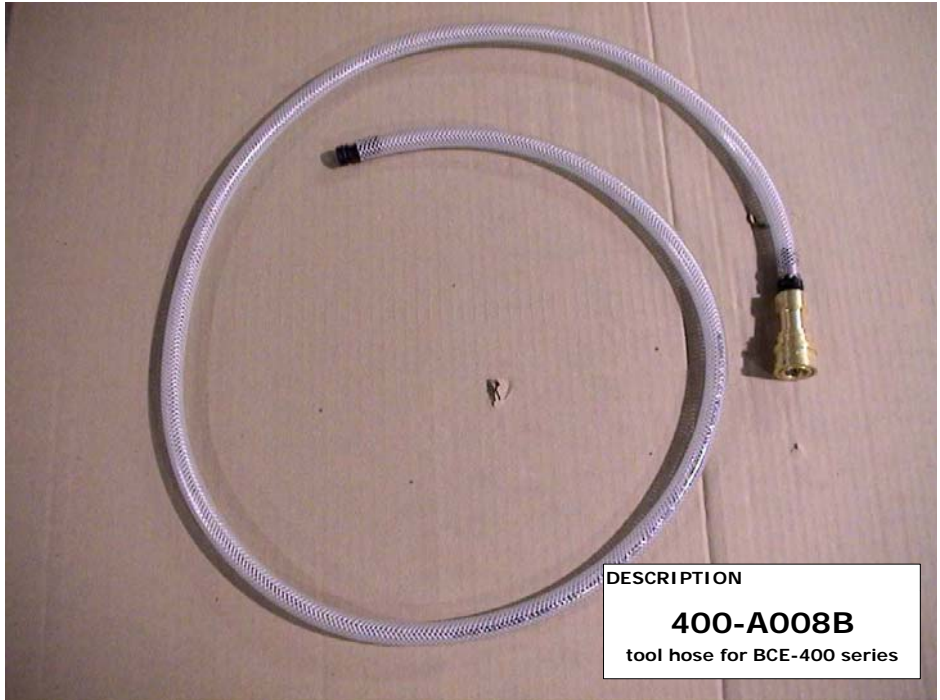
DESCRIPTION 400-A008B tool hose for BCE-400 series