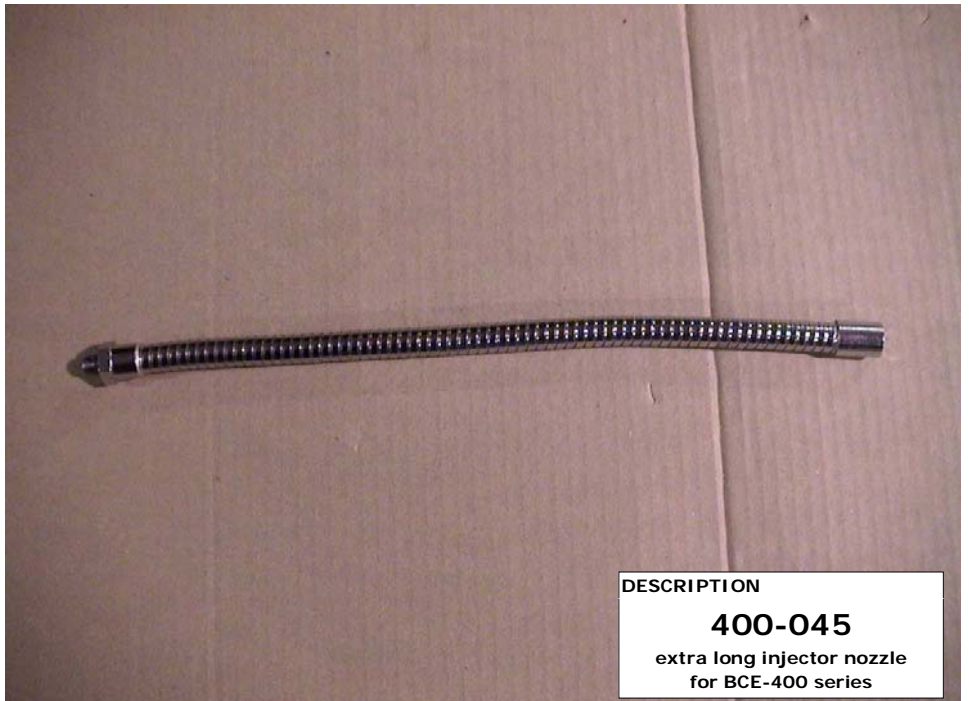
DESCRIPTION 400-045 extra long injector nozzle for BCE-400 series